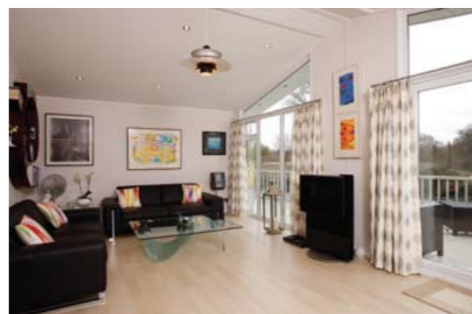
Interior of their completed home which overlooks the river Ouse.