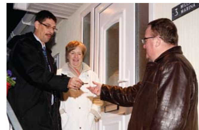
Receiving the keys to their new home from the park estate sales manager.