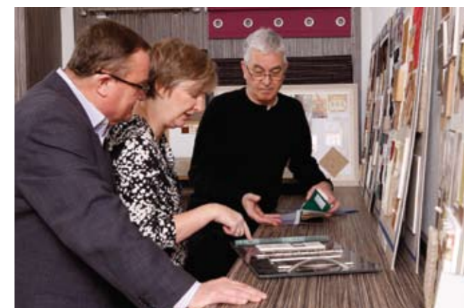
At Prestige offices choosing items for the specification of their home.