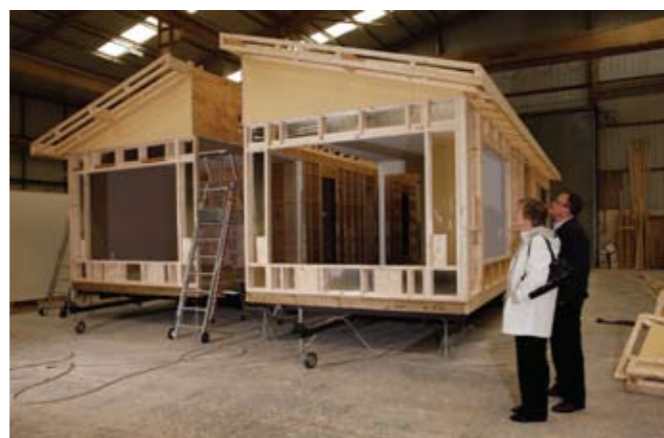
Early stages of build in the factory at Prestige.